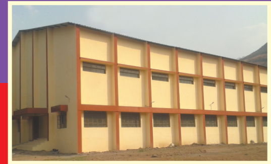
Indoor Sports Hall