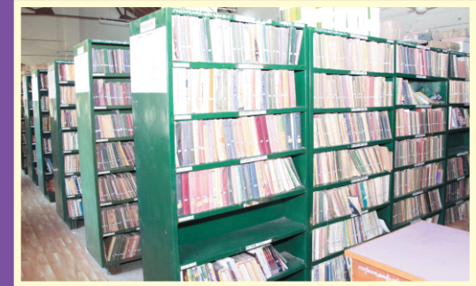
Library & Information Centre